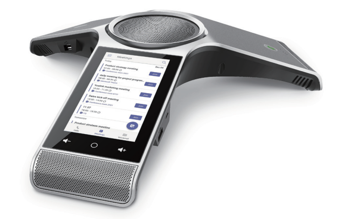
Android OS 3-Microphone