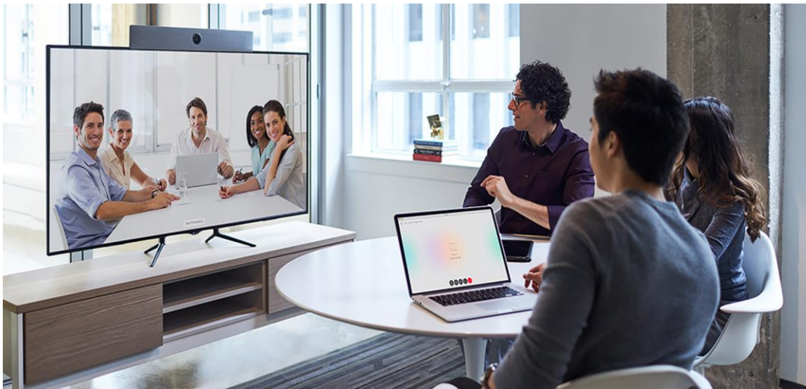
Figure 1. Cisco Webex Room Kit in small room scenario

The Room Kit – which includes camera, codec, speakers, and microphones integrated in a single device – is ideal for rooms that seat up to seven people. It offers sophisticated camera technologies that bring speaker-tracking capabilities to smaller rooms. The product is rich in functionality and experience but is priced and designed to be easily scalable to all of your small conference rooms and spaces – whether registered on the premises or to Cisco Webex.