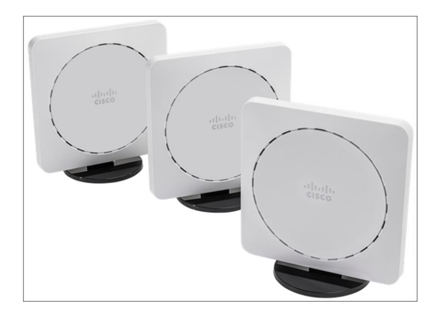
Figure 5. From top to bottom, Cisco IP DECT Phone RPW-110 Repeater, Cisco IP DECT DBW-110 Single-Cell Base and Cisco IP DECT DBW-210 Multi-Cell Base Station in white plastics

Note: the white plastics are offered on a build to order basis with longer lead times than the gray plastics. White plastics will be available in November 2020.