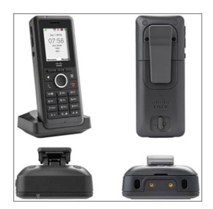
Figure 1. Cisco IP DECT 6823 Handset