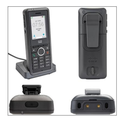
Figure 2. Cisco IP DECT 6825 Handset