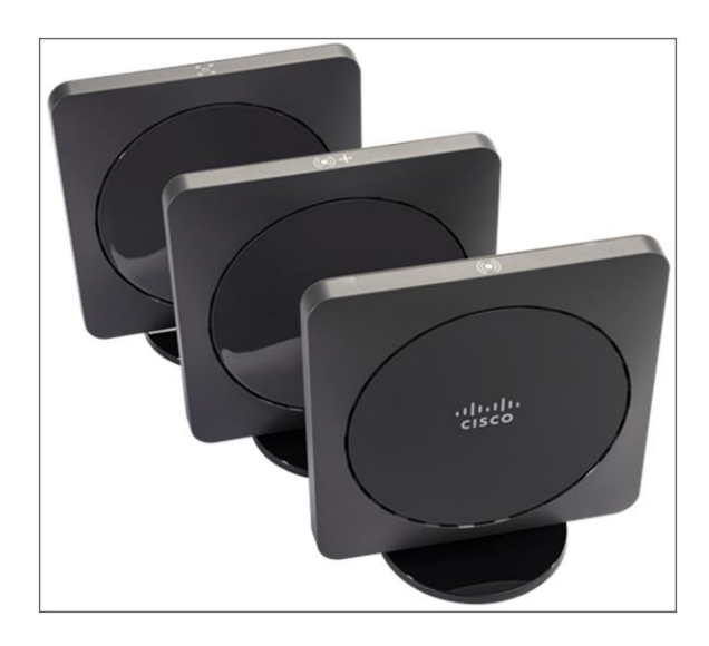
Figure 4. From top to bottom, Cisco IP DECT Phone RPT-110 Repeater, Cisco IP DECT DBS-210 Multi-Cell Base Station and Cisco IP DECT DBS-110 Single-Cell Base Station