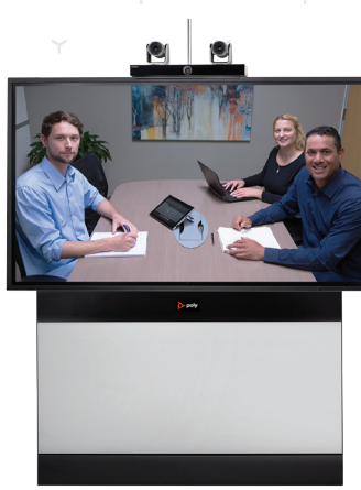
Medialign single 75 inch in gray