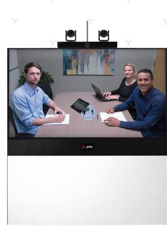
Medialign single 65 inch in white