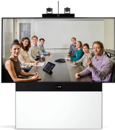
Medialign single 86 inch in white