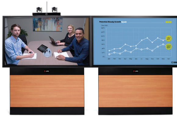
Medialign dual 75 inch in applewood