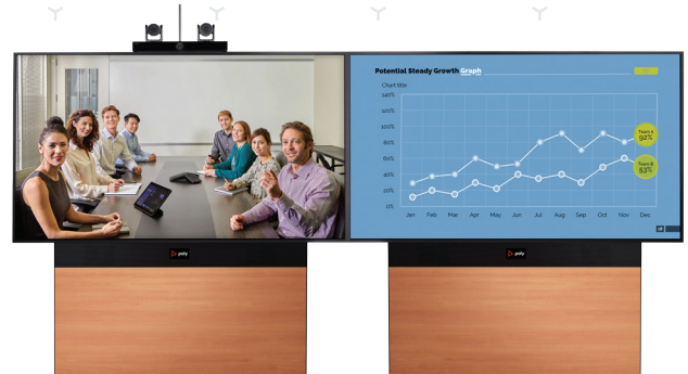
Medialign dual 86 inch in applewood