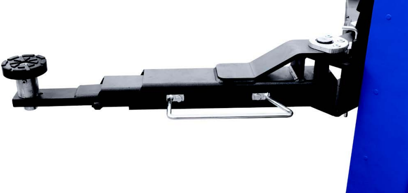
Dead man controls, 24V