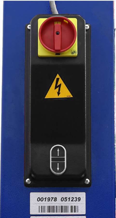
Dead man controls, 24V