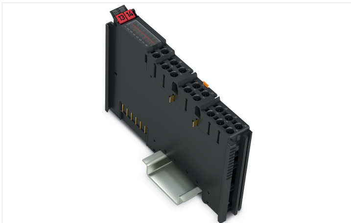
Color: dark gray