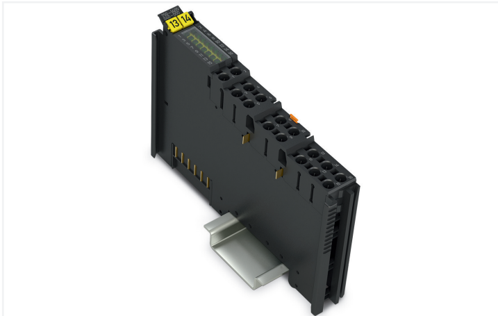
Color: dark gray