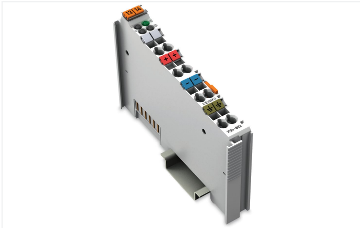
Color: light gray