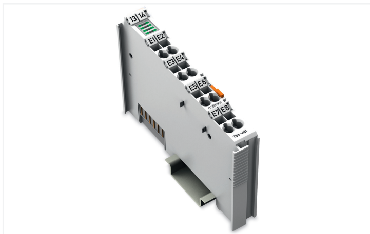
Color: light gray