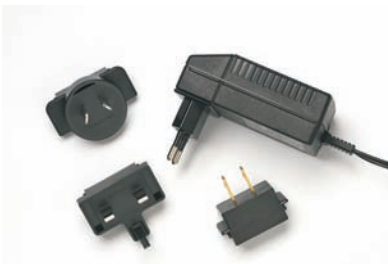
Worldwide compatible AC adapter/charger (SNT-121A)