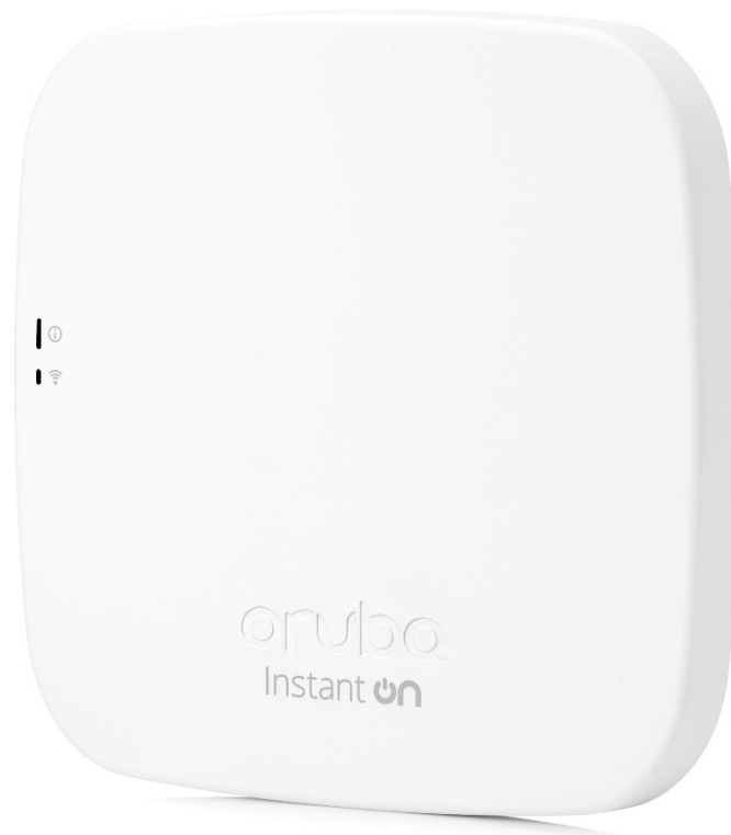
Aruba Instant On AP11 Indoor Access Points

Whether you own a small retail store or a boutique shop, your employees and customers are relying on the network for almost everything they do. And because Wi-Fi plays such a crucial role today, you need a purpose-built solution that keeps your business on the go. Aruba Instant On Access Points (APs) are easy to deploy and manage—with a quality look and feel at an attractive price point.