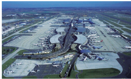
AIRPORT ROISSY CHARLES DE GAULLE PARIS, FRANCE