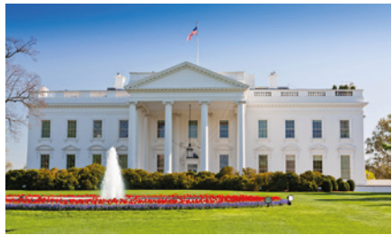
THE WHITE HOUSE WASHINGTON D.C., USA