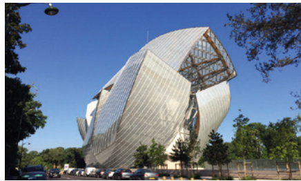
FONDATION LOUIS VUITTON PARIS, FRANCE