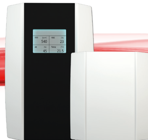
NOVOS 5 Design