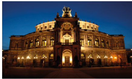
SEMPER OPERA DRESDEN, GERMANY