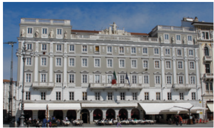
GENERALI I, HEADQUARTERS TRIESTE, ITALY