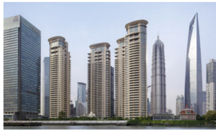
TOMSON RIVIERA APARTMENT TOWERS SHANGHAI, CHINA