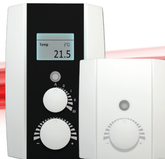
NOVOS 5 x Design