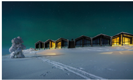
STAR ARCTIC HOTEL SAARISELKÄ, FINLAND