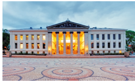
UNIVERSITY OSLO OSLO, NORWAY