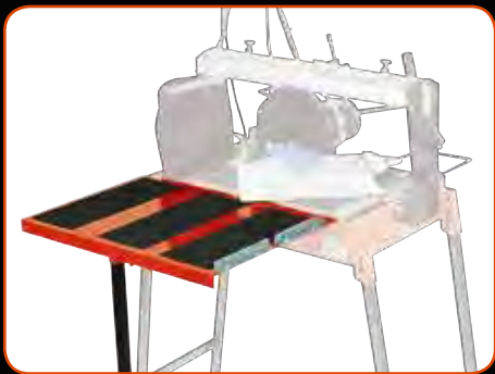
EXTENSION SIZE TABLE Very practical when cutting big tile sizes. (Optional: Art 85015)