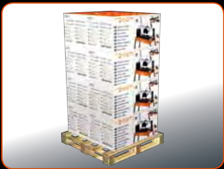
PACKAGING Multilingual flexographed packaging