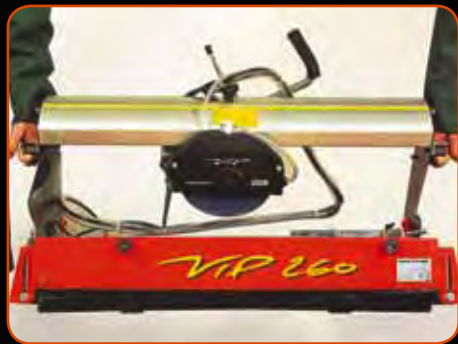
TRANSPORT Very easy to carry. Folding legs under the frame