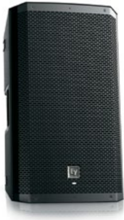
12 ZLX-12P 12" TWO-WAY POWERED LOUDSPEAKER

The compact, lightweight ZLX-12P was designed to give you power and performance beyond the scope of other small-format loudspeakers, making it a standout choice for smaller-venue sound reinforcement or stage-monitoring. Pound for pound, no other similarly sized composite box comes close.