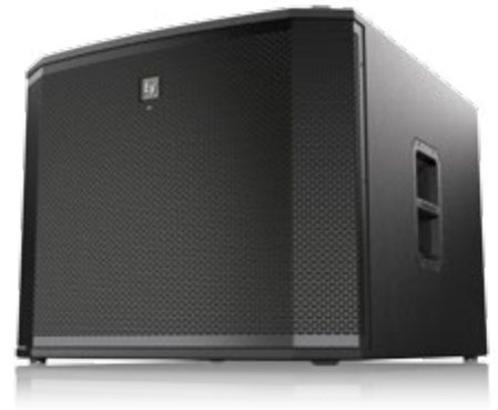
18 SUB ETX-18SP 18" POWERED SUBWOOFER

18" DVX woofer for extended low-frequency response