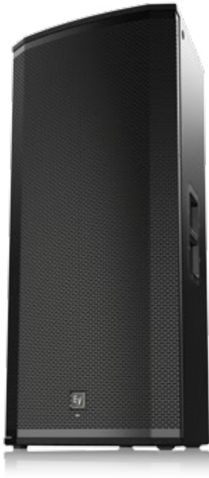
35 ETX-35P 15" THREE-WAY POWERED LOUDSPEAKER