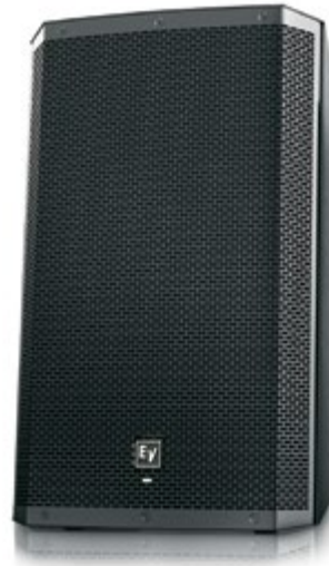
15 ZLX-15P 15" TWO-WAY POWERED LOUDSPEAKER

Extend your low-end with this portable powerhouse. Whether used on its own or with a sub, the ZLX-15P provides crisp, clean highs and tight, deep lows for larger spaces – all with enough amplifier headroom to make sure you're heard both loudly and clearly.