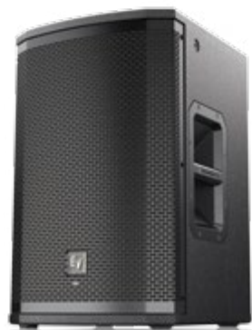
10 ETX-10P 10" TWO-WAY POWERED LOUDSPEAKER