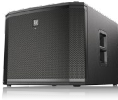
15 SUB ETX-15SP 15" POWERED SUBWOOFER