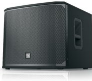
15 SUB EZX-15S

90° x 60° pattern for best coverage on mid-size stages. 40° monitor angle with rubber feet.