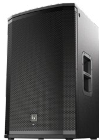
15 ETX-15P 15" TWO-WAY POWERED LOUDSPEAKER