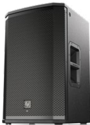
12 ETX-12P 12" TWO-WAY POWERED LOUDSPEAKER